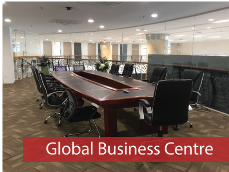
Global Business Centre